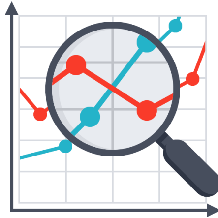
Trading Indicator: Crypto-Adjusted Moving Average